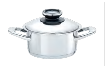
Pots Pages 26-31